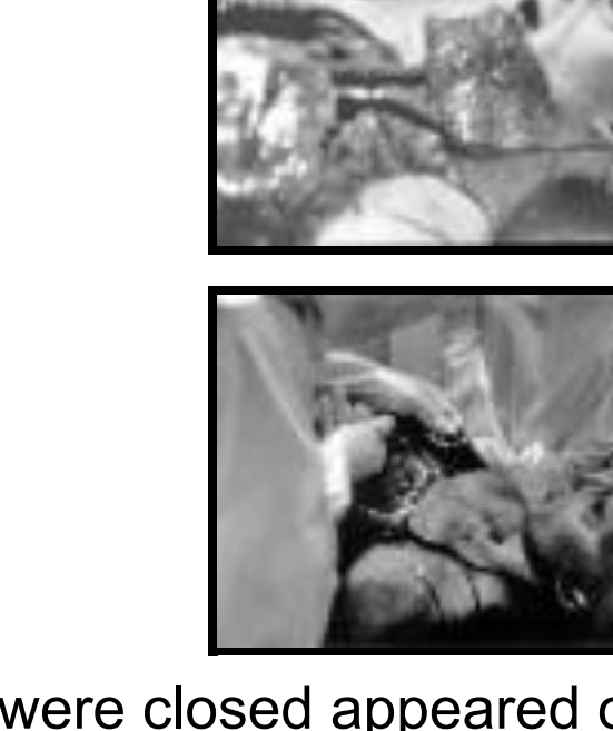
Photo was taken at angle, side view, looking at body from 45° elevation, left hand was .visible, head on right, feet on left), eyes were closed appeared oriental-looking and almond shaped, left hand slight longer than normal, wrist coming down Just about 2 to 3 Inches above the knees. Wrists appeared to be articulated In a fashion that allowed a double Joint with 3 digit fingers. Wrist was very slender. There was no thumb. A palm was almost nonexistent. The three fingers were direct extension from the wrist.

Color of the skin was bluish gray, dark bluish gray. At base of the body there was a darker color, Indicating body was dead for some time. Body fluid or blood had settled to base of body. This indicated that body had been examined before beginning autopsy.