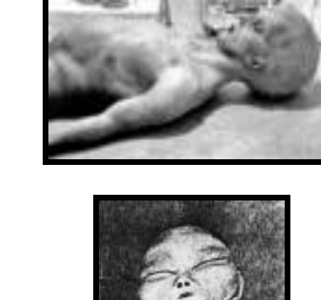
Photo number 1 showed an alien being on an autopsy table which is a metal table with runnels and traps underneath to trap fluid and feces. Body appeared to be a little short of 4 feet. Table was about 7 foot. No clothing on body, no genitalia, body completely heterous, head was rounded cranium, slightly enlarged, eyes almond shaped, slits where nose would be, extremely small mouth, receding chin line, holes where ears would be.

UFO. It also dealt with alien bodies and autopsy reports, autopsy type photographs, high quality, color, 8x10, 5x7.